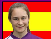
8 GIRO MARIA