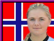
10 FIDJE METTE