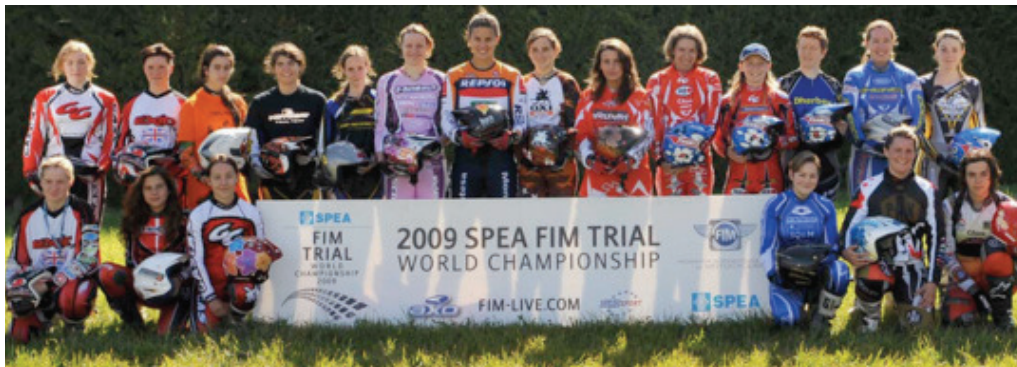
Riders at the first WC round in Andorra 2009