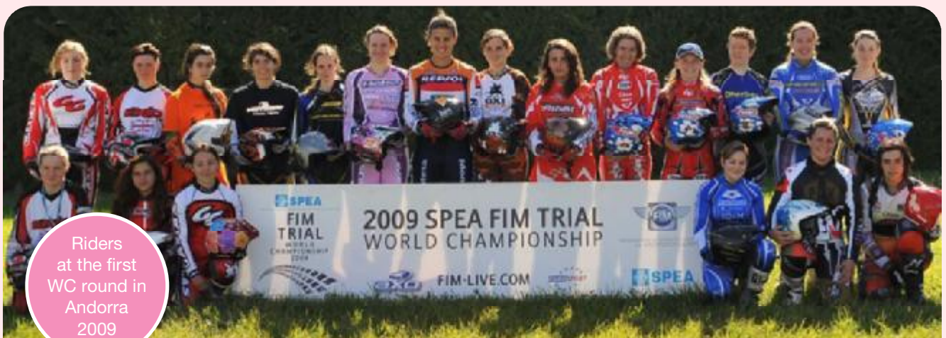
Riders at the first WC round in Andorra 2009

We really need opinions and contributions from YOU. Feel free to send us reports from your country or team. Tell us who you would like us to portrait. Tell us what you would like to read about.